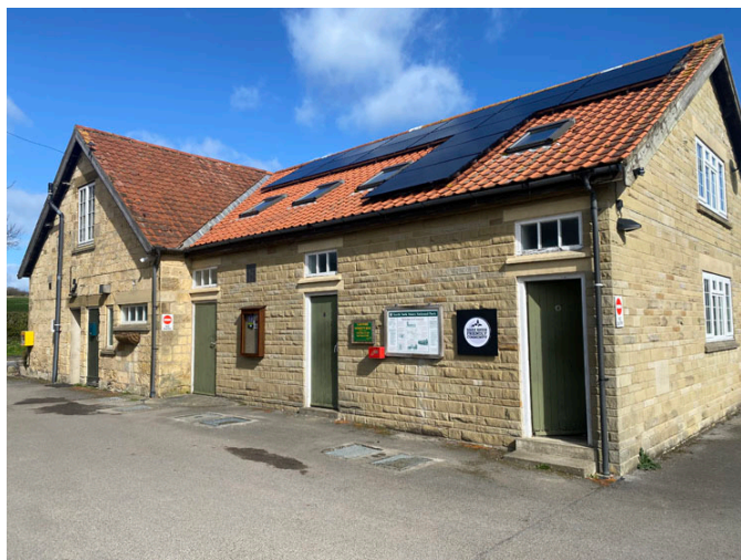
The Village Hall, Honesty Box and the 1926 Foundation Stone