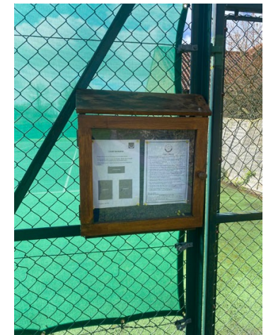
"Notice" a button at B