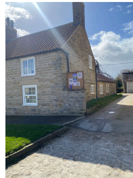
The Lych Gate, Church noticeboard, and another board too!