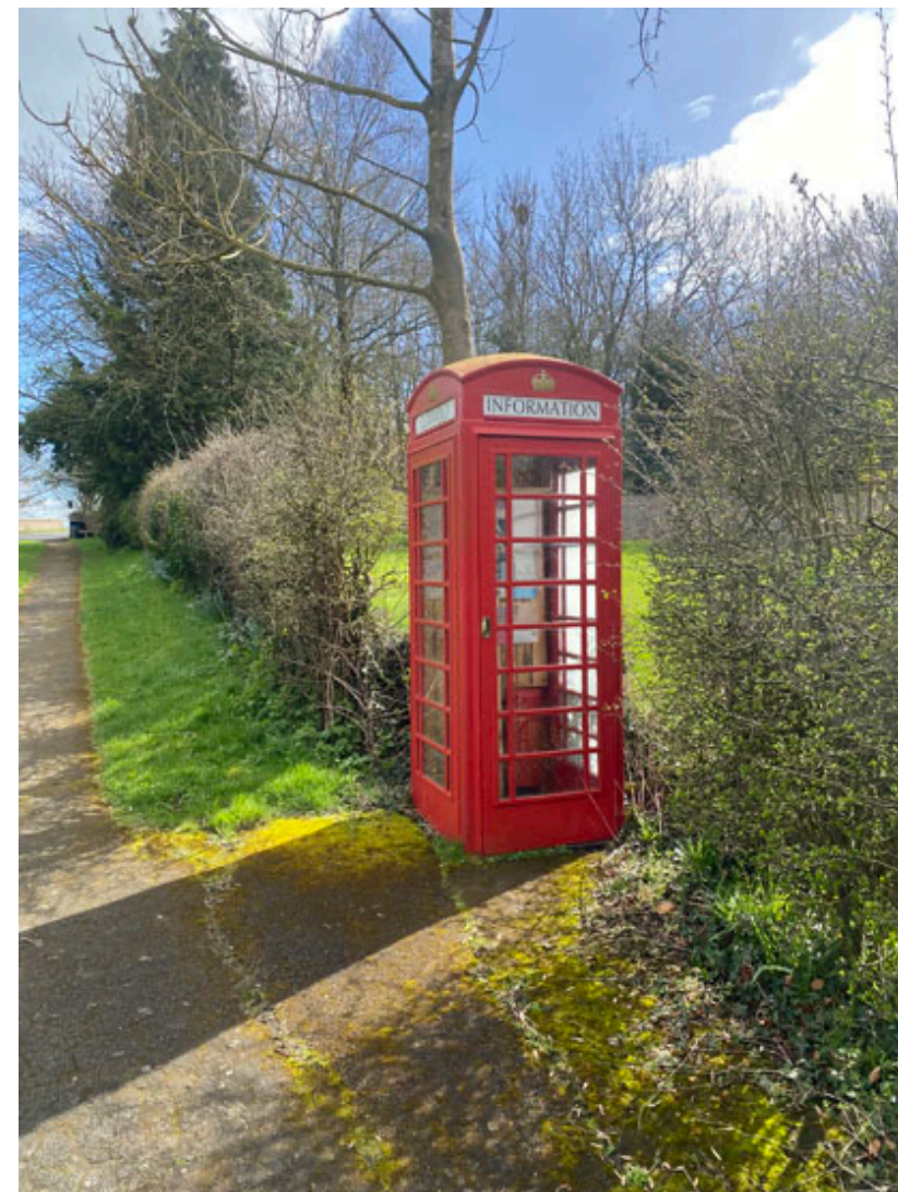
The Phone Box – Coxwold's mini-information office!