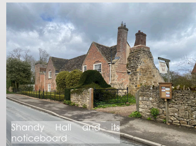
Shandy Hall and its noticeboard

Sterne lived in Shandy Hall from 1760 to 1768 as perpetual curate of Coxwold, while making frequent journeys to London to promote his writings and enjoy city life.