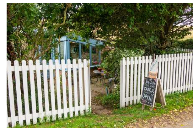
The Honesty café E