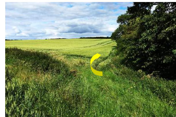
SE 5248 7686 – turn right here, up the hill