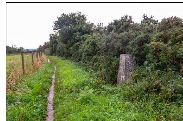
Trig point C at the top of Beacon Banks. Views to the left and right, over the hedge!